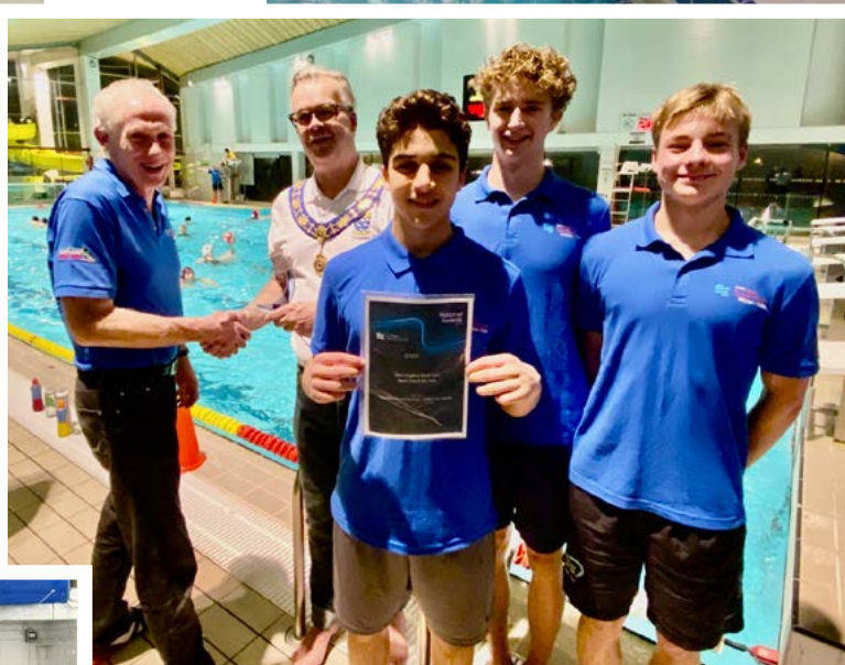
Above: Worthing Swimming Club, Water Polo Section