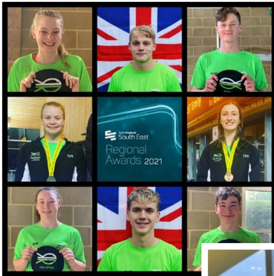
Above: Rushmoor Captains – Engagement Innovation