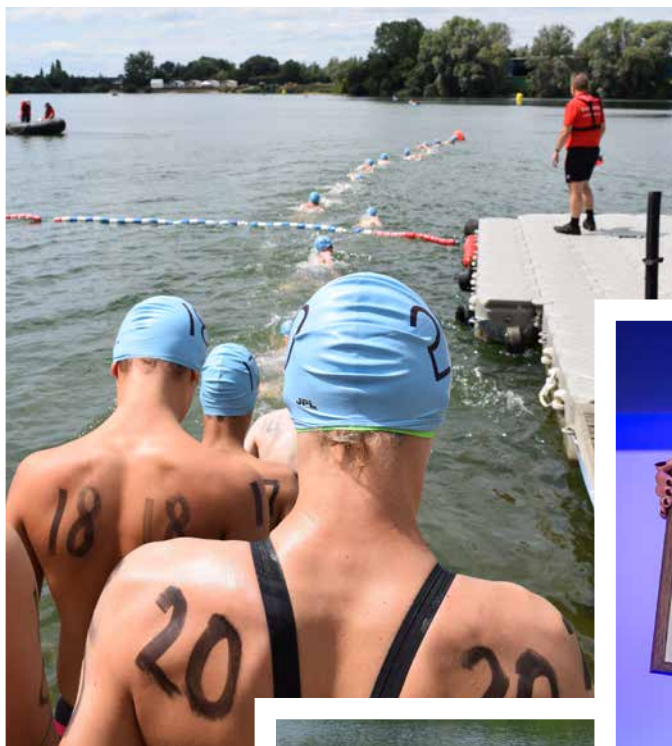
Above: 2019 Open Water Championships