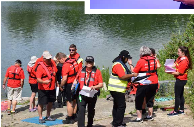
Right: Volunteers at the Open Water Championships